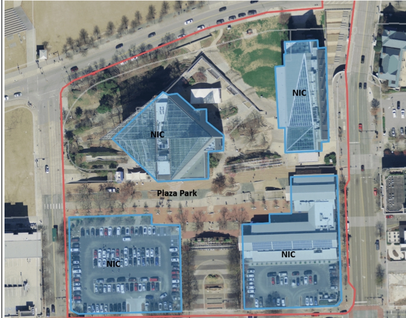
Exhibit D - Updated Map